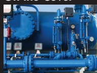
Production Testing - 1,440 psi High Pressure Three-Phase Test Separator