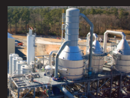
Fluids - Liquid/Flake Calcium Chloride Manufacturing Plant (El Dorado, Arkansas)