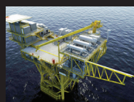
Maritech - EC 328B Production Facility