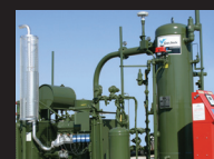
Compressco - GasJack® Wellhead Compression Unit