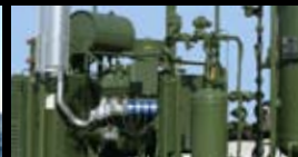
Compressco® - GasJack® Wellhead Production Enhancement Unit.