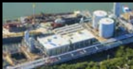
Maritech® - Timbalier Bay Oil & Gas Production Facility.