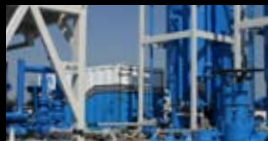
Production Testing - High Pressure, High Temperature Rig Up.