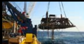
Offshore Services - DB-1 Derrick Barge Decommissioning Operation.