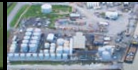
Fluids - GOM Deepwater Clear Brine Fluids Blending Plant & Service Facility (Fourchon, Louisiana).